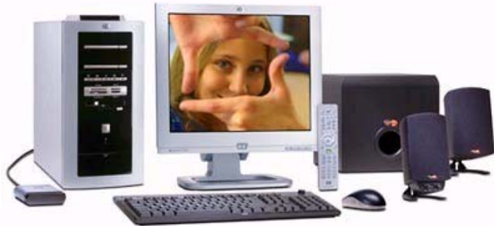
Picture shown may not be actual system.

2901 Gordon Avenue Santa Clara, CA 95051 T: 408-720-8899 F: 408-720-8848 www.comtequsa.com